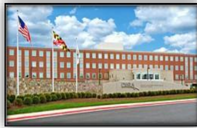
Fort George G. Meade, Maryland