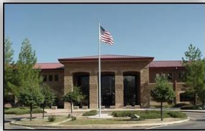
Fort Huachuca, Arizona